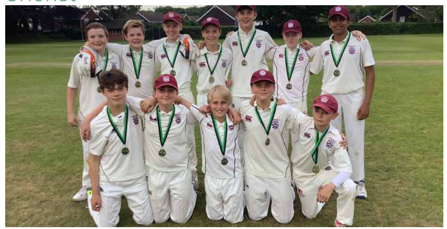
Congratulations to the U13A cricket team on becoming County Champions

Well done to the following pupils who have been selected by Worcester CCC to play at U11: